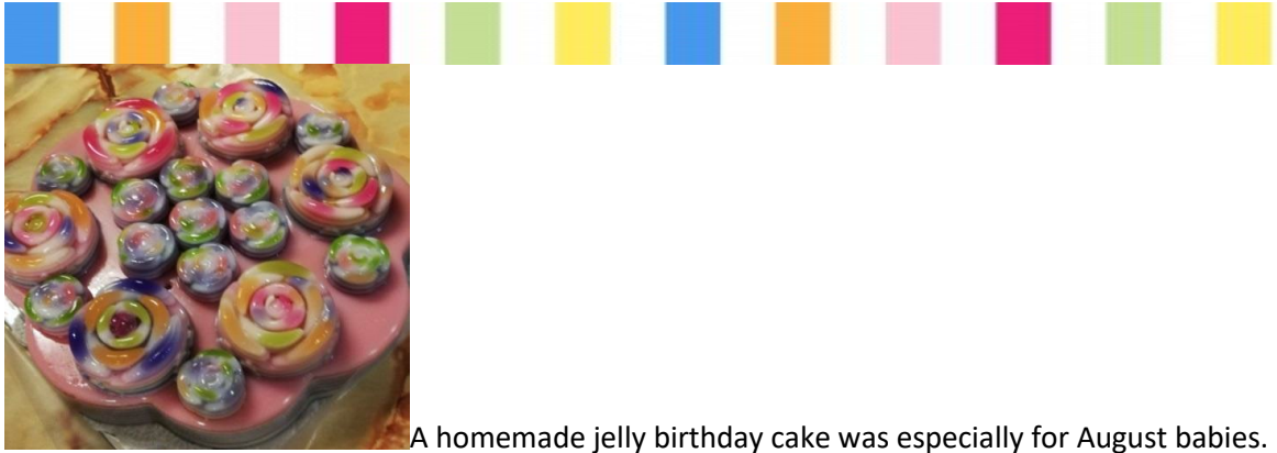
A homemade jelly birthday cake was especially for August babies.