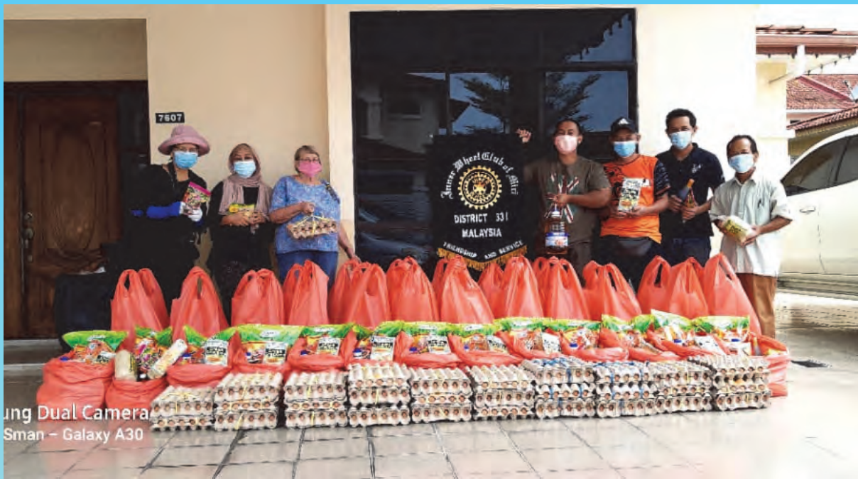
ung Dual Camera Sman – Galaxy A30

They bought almost RM100 of food items for 30 poor families who had disabled members. We first loaded the all the food items into three cars at Heilda’s house.