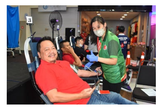
Donors doing their part to help the local community (Left and right)